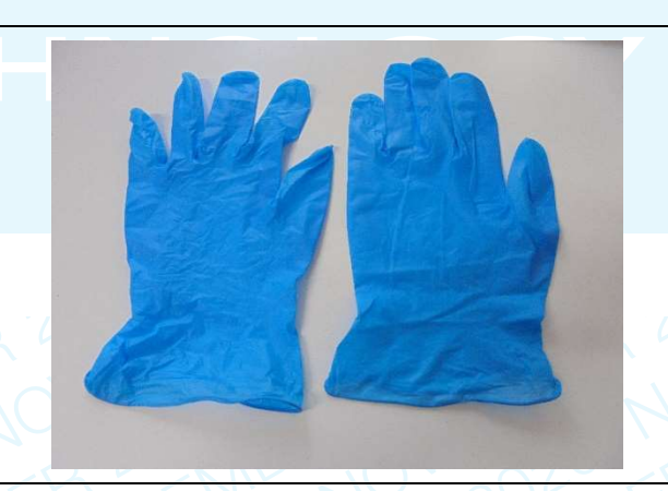
Saniform Nitrile / Vinyl Hybrid Composite gloves